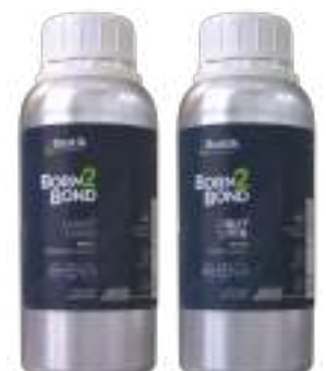
500g bottles for LIGHT LOCK MV & HV