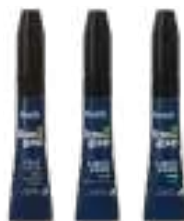
5g alu tubes for LIGHT LOCK MV, HV & Gel

The first odorless light-curing cyanoacrylate