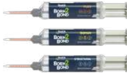
10g syringes for FLEX, REPAIR & STRUCTURAL

Two-component adhesives with advanced properties