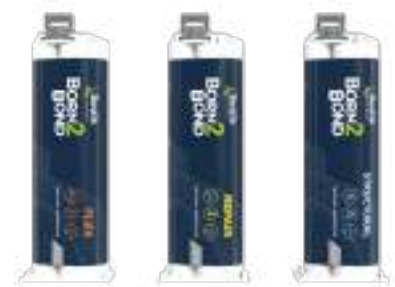
50g syringes for FLEX, REPAIR & STRUCTURAL