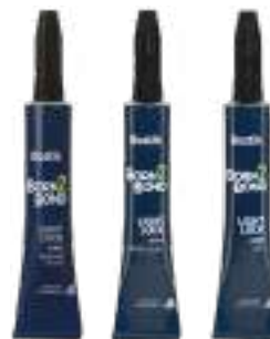
20g alu tubes for LIGHT LOCK MV, HV & Gel