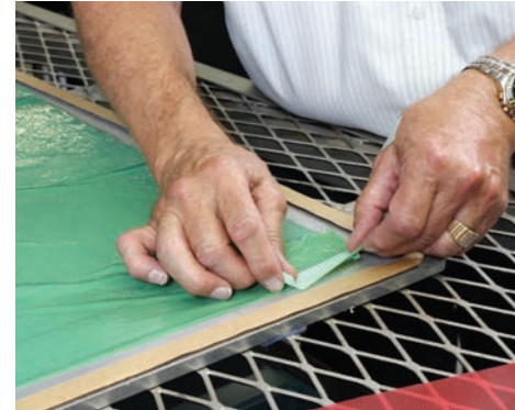
Works inside the bagging area to securely hold/position laminate plies, release liners, bagging materials and thermal couple wires while providing clean removal post cure.