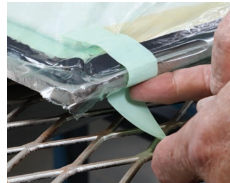
Works outside the bagging area to securely hold/position bagging materials and thermal couple wires while providing clean removal from tooling post cure.